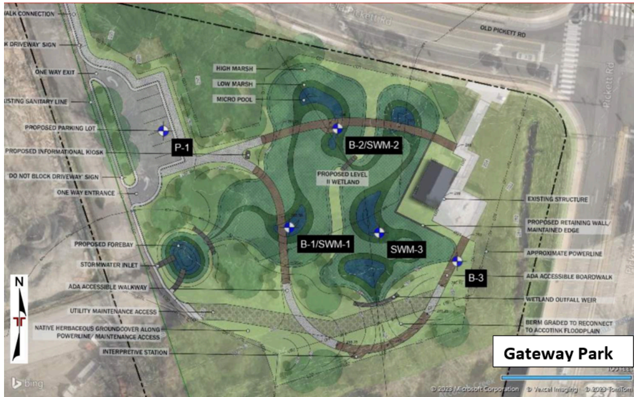
The future Gateway Park